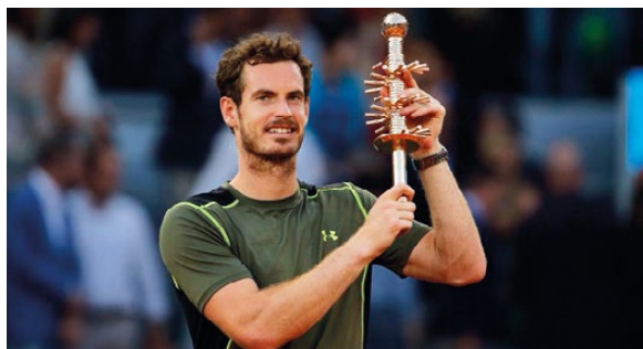
Andy Murray continues to lead the way for British tennis players